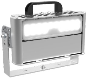
ALDEBARAN® RAPTOR RP500 LED