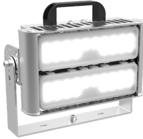
ALDEBARAN® RAPTOR RP1000 LED | RAPTOR RP2000 LED RAPTOR RP2000 LED 12/24V