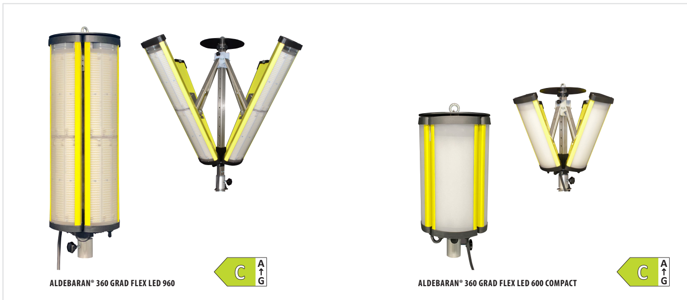
ALDEBARAN® 360 GRAD FLEX LED 960