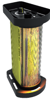
ALDEBARAN® 4000A X1 TRAFFIC